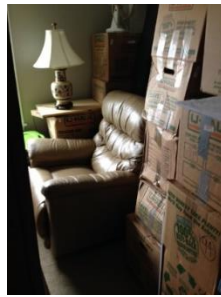
Caption: Online writing freedom can be had anywhere!

When we moved into our new apartment in New Hampshire on September 20, we quickly realized there was not enough room for everything. There was definitely no place for an office. For a while I went into the second bedroom to work. This was not ideal, but I got my work finished on time.